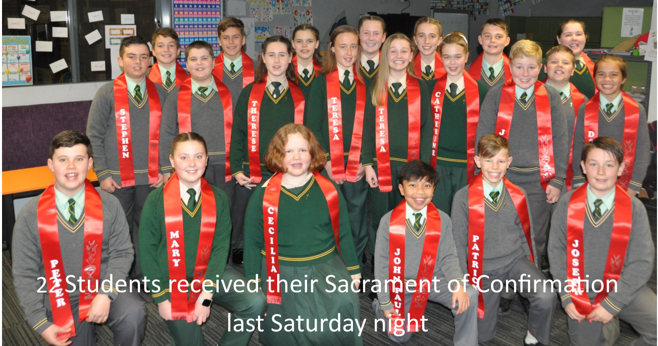
22 Students received their Sacrament of Confirmation last Saturday night

Phone: (02) 60251122 Web page: www.hsslavington.com Email: hs-info@ww.catholic.edu.au