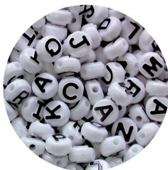
Pony Beads Alphabet Mixed 350pc 10mm Diameter